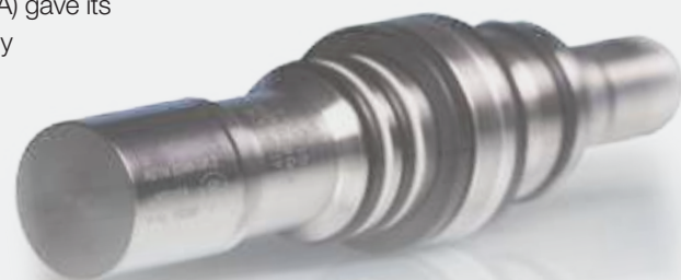
120 kHz transducer