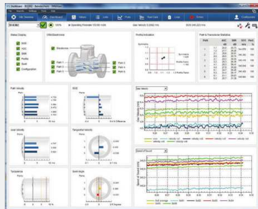
RMGView USM facilitates real-time performance monitoring of CBM parameters