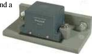
926FS30 Railwheel Proximity Sensor, mounted with RDS-CL-02 Through-Rail Bracket

The 926FS30 Series of Railwheel Proximity Sensors are specially designed and constructed for rail wheel detection at speeds up to 281 miles (450 km) per hour. These two-wire DC inductive proximity sensors also detect train speed and direction. The superior reliability of the 926FS30 Series of Railwheel Proximity Sensors is built on Honeywell electromagnetic technology. The sensors consist of an oscillator, demodulator, and a trigger circuit that produces a digital current. The sensor's high-frequency oscillator contains an open magnetic circuit and creates an alternating current. This current generates an electromagnetic field. When a metal object, such as a railwheel, passes through the field, the oscillator is dampened, and the magnitude of the output current is reduced. Low- and high-frequency sensors are used together to prevent oscillators from influencing one another.