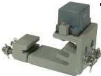
926FS30 Railwheel Proximity Sensor, mounted with RDS-CL-01 Underrail Clamp

For quick and easy installation, the sensors may be attached to the track using an underrail clamp that requires no drilling or machining. A bracket set also is available.