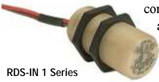
RDS-IN 1 Series Interface Module

The 926FS30 Series of Railwheel Proximity Sensors are specially designed and constructed for rail wheel detection at speeds up to 281 miles (450 km) per hour. These two-wire DC inductive proximity sensors also detect train speed and direction. The superior reliability of the 926FS30 Series of Railwheel Proximity Sensors is built on Honeywell electromagnetic technology. The sensors consist of an oscillator, demodulator, and a trigger circuit that produces a digital current. The sensor's high-frequency oscillator contains an open magnetic circuit and creates an alternating current. This current generates an electromagnetic field. When a metal object, such as a railwheel, passes through the field, the oscillator is dampened, and the magnitude of the output current is reduced. Low- and high-frequency sensors are used together to prevent oscillators from influencing one another.