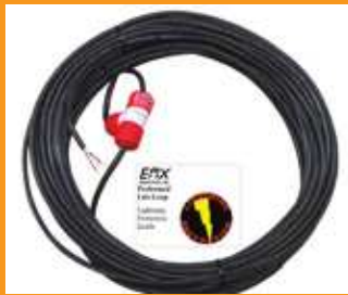
PR-XX (light preformed loop with lighting protection)

The ULTRAMETER™ display makes installation, set-up and troubleshooting easy. Each time a vehicle is moved onto the loop, the display indicates the sensitivity necessary to detect vehicle. Simply set the sensitivity to the value displayed to detect the vehicle. Interference or crosstalk from adjacent loops or other sources are displayed as a constantly varying number on the ULTRAMETER™. This condition may be avoided by maintaining a minimum of 5 kHz separation in multi-loop applications.