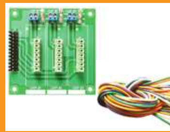
ULTRA II-MB (Ultra II Motherboard)