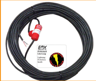
PR-XX (light preformed loop with lighting protection)

The ULTRAMETER™ display makes installation, set-up and troubleshooting easy. Each time a vehicle is moved onto the loop, the display indicates the sensitivity necessary to detect vehicle. Simply set the sensitivity to the value displayed to detect the vehicle. Interference or crosstalk from adjacent loops or other sources are displayed as a constantly varying number on the ULTRAMETER™. This condition may be avoided by maintaining a minimum of 5 kHz separation in multi-loop applications.