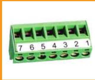
LD-7P 7 position plug terminal for wiring (included)