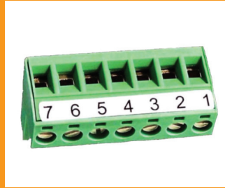
LD-7P 7 position plug terminal for wiring (included)