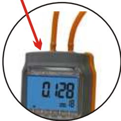
PC connection port