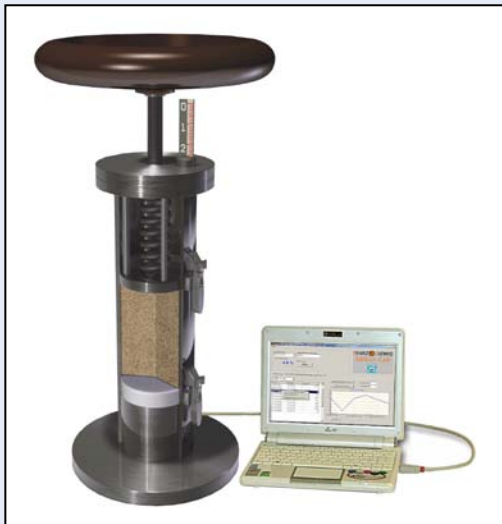
Picture 1: FL-MIKRO-LAB with measured value evaluation at a Laptop /PC

Systems indicating the moisture content of material samples must be fast and accurate. It supports laboratories for quality as well as product management, which are typical applications. It can be used during the raw material delivery as well as during the production process.