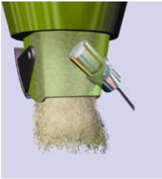
Wear Protection Tube Item-No. Z30362