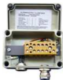
Clamp Connecting Box